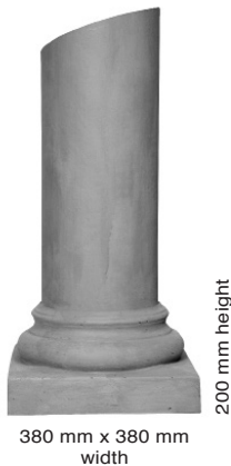
Square 200 Pipe I/D