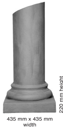
Square 250 Pipe I/D